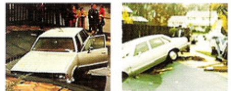
1979: The Safety Pool Cover and the Car In 1979 a car went out of control and landed on top of a Meyco cover. Incredibly, the car remained supported by the cover (after the driver had walked across it to safety).