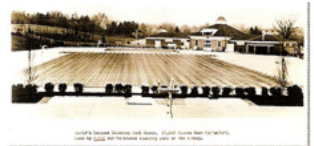
1964: World's Largest Swimming Pool Cover Meyco built this 15,640 Sq. Ft. (92' x 170') monster for Maplewood Township Pool in New Jersey.